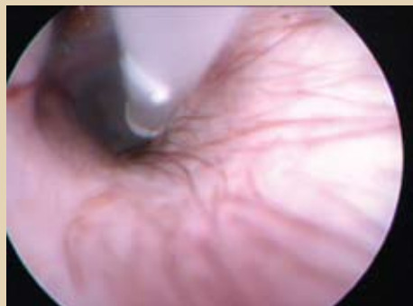
Figure 1: Myringotomy Incision